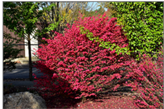
Little Moses Burning Bush in fall