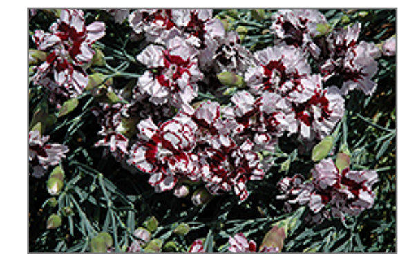
Coconut Punch Pinks flowers