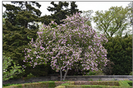
Jane Magnolia in bloom