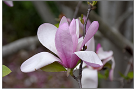
Jane Magnolia flowers

This shrub does best in full sun to partial shade. It requires an evenly moist well-drained soil for optimal growth, but will die in standing water. It is not particular as to soil type, but has a definite preference for acidic soils. It is quite intolerant of urban pollution, therefore inner city or urban streetside plantings are best avoided. Consider applying a thick mulch around the root zone in winter to protect it in exposed locations or colder microclimates. This particular variety is an interspecific hybrid.