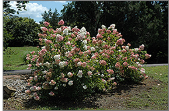
Vanilla Strawberry Hydrangea in bloom