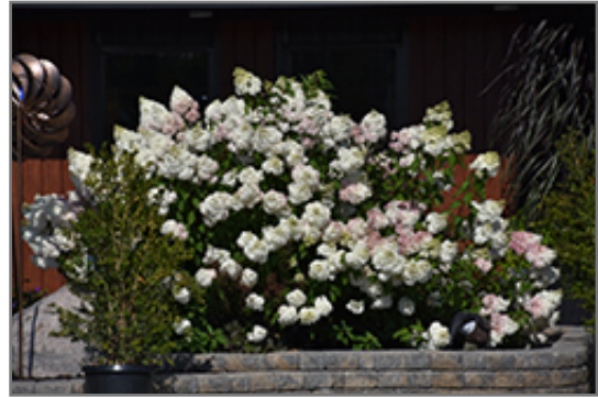
Vanilla Strawberry Hydrangea in bloom

This shrub performs well in both full sun and full shade. It prefers to grow in average to moist conditions, and shouldn't be allowed to dry out. It is not particular as to soil type or pH. It is highly tolerant of urban pollution and will even thrive in inner city environments. Consider applying a thick mulch around the root zone in winter to protect it in exposed locations or colder microclimates. This is a selected variety of a species not originally from North America.