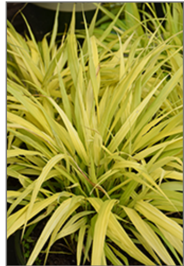
All Gold Hakone Grass foliage