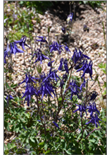
Common Columbine flowers

Common Columbine is recommended for the following landscape applications;