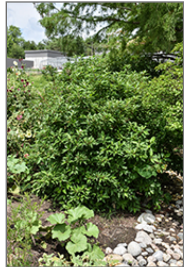
Bergeson Compact Dogwood

Bergeson Compact Dogwood is recommended for the following landscape applications;