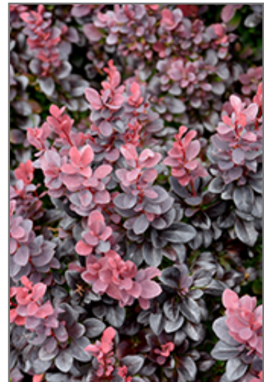
Concorde Japanese Barberry foliage