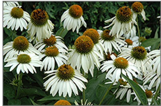
White Swan Coneflower flowers

White Swan Coneflower is recommended for the following landscape applications;