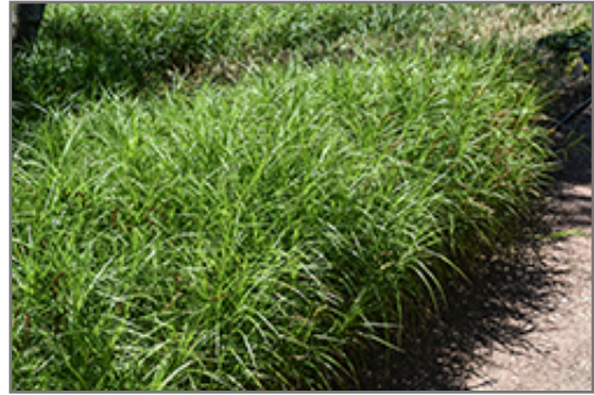
Palm Sedge