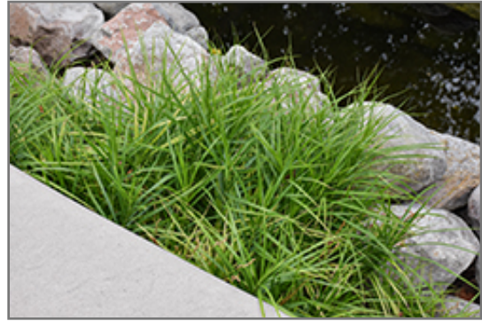
Palm Sedge

Palm Sedge is a fine choice for the garden, but it is also a good selection for planting in outdoor pots and containers. It is often used as a 'filler' in the 'spiller-thriller-filler' container combination, providing a canvas of foliage against which the thriller plants stand out. Note that when growing plants in outdoor containers and baskets, they may require more frequent waterings than they would in the yard or garden.