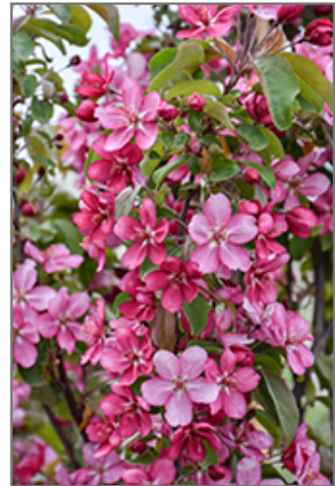
Red Barron Flowering Crab flowers