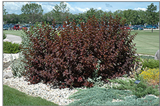
Diablo Ninebark