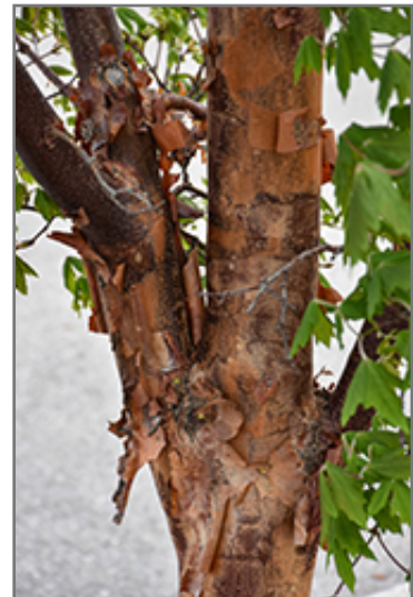
Paperbark Maple bark