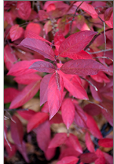
Henry's Garnet Virginia Sweetspire in fall

* This is a 'special order' plant - contact store for details