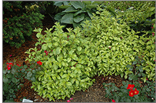
Ghost Weigela

This shrub should only be grown in full sunlight. It prefers to grow in average to moist conditions, and shouldn't be allowed to dry out. It is not particular as to soil type or pH. It is highly tolerant of urban pollution and will even thrive in inner city environments. This is a selected variety of a species not originally from North America.