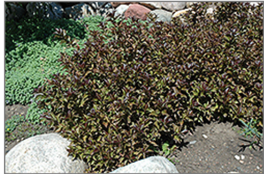
Dark Horse Weigela