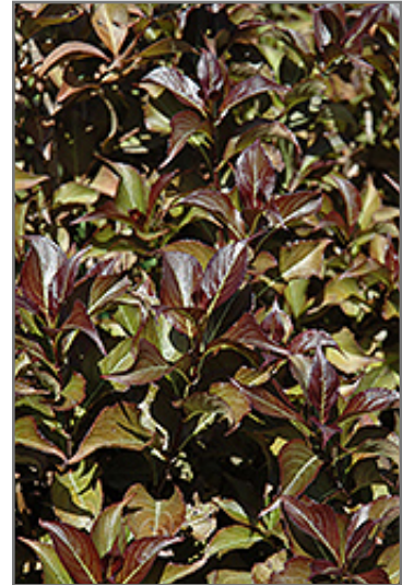
Dark Horse Weigela foliage

Dark Horse Weigela makes a fine choice for the outdoor landscape, but it is also well-suited for use in outdoor pots and containers. Because of its height, it is often used as a 'thriller' in the 'spiller-thriller-filler' container combination; plant it near the center of the pot, surrounded by smaller plants and those that spill over the edges. It is even sizeable enough that it can be grown alone in a suitable container. Note that when grown in a container, it may not perform exactly as indicated on the tag - this is to be expected. Also note that when growing plants in outdoor containers and baskets, they may require more frequent waterings than they would in the yard or garden.