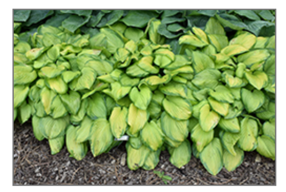
Stained Glass Hosta