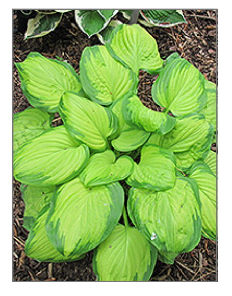
Stained Glass Hosta