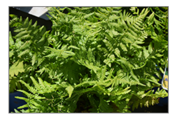
Robust Male Fern foliage