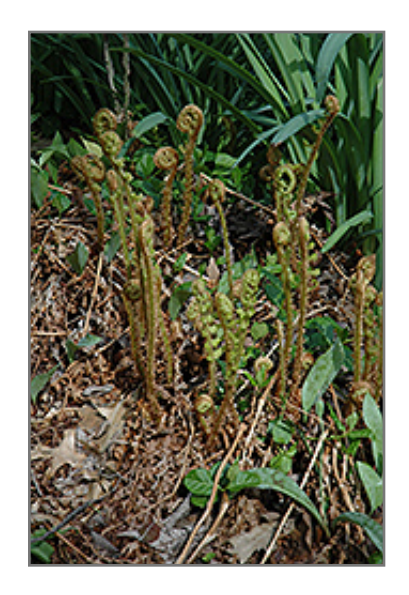
Robust Male Fern in spring

Harvard Nursery, Inc 5801 Island Rd • Harvard, Illinois 60033 • (815) 943-5015 www.harvardnursery.com