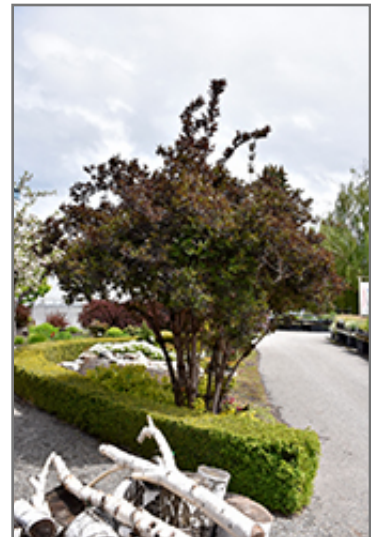
Black Beauty Elder