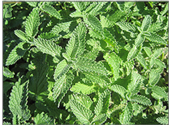
Walker's Low Catmint foliage

Walker's Low Catmint is a fine choice for the garden, but it is also a good selection for planting in outdoor pots and containers. It is often used as a 'filler' in the 'spiller-thriller-filler' container combination, providing a mass of flowers against which the thriller plants stand out. Note that when growing plants in outdoor containers and baskets, they may require more frequent waterings than they would in the yard or garden.