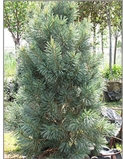
Vanderwolf's Pyramid Pine