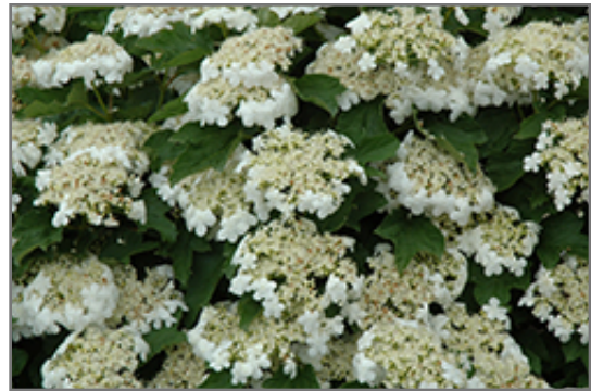
Compact European Cranberry flowers