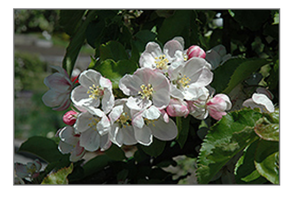
Jonagold Apple flowers