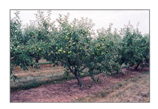
Jonagold Apple

* This is a 'special order' plant - contact store for details