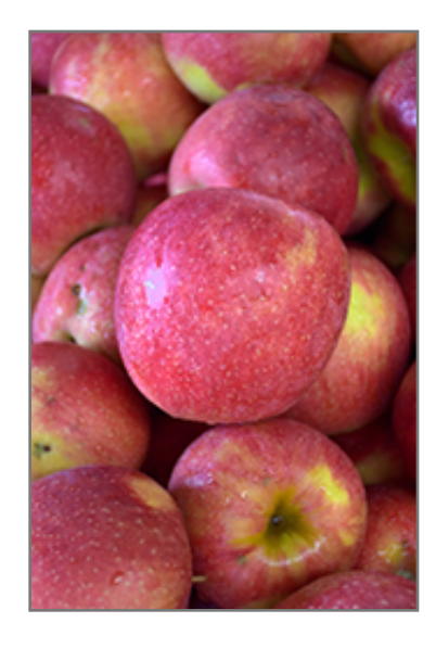
Jonagold Apple fruit

Jonagold Apple features showy clusters of lightly-scented white flowers with shell pink overtones along the branches in mid spring, which emerge from distinctive pink flower buds. It has forest green deciduous foliage. The pointy leaves turn yellow in fall. The fruits are showy yellow apples with a scarlet blush, which are carried in abundance in mid fall. The fruit can be messy if allowed to drop on the lawn or walkways, and may require occasional clean-up.